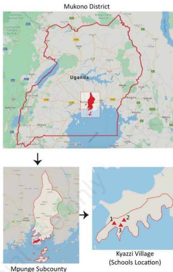
Figure 2. Field map.